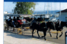
Tour Mackinac Island by Horse and Carriage