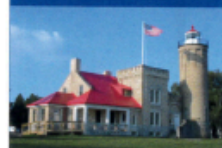
Mackinac Point Lighthouse