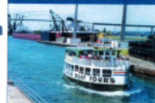
Soo Locks Cruise in Sault Sainte Marie