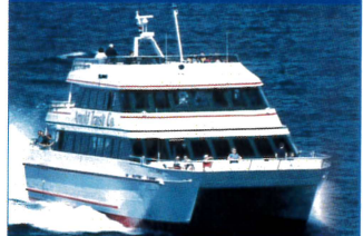
Mackinac Island Ferry