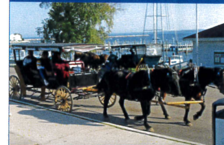
Tour Mackinac Island by Horse and Carriage