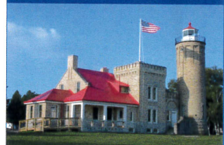
Mackinac Point Lighthouse