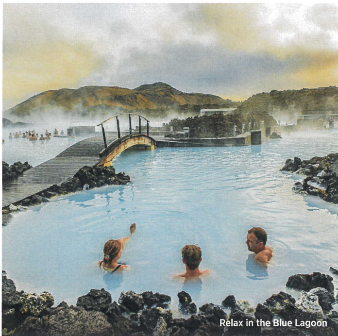
Relax in the Blue Lagoon