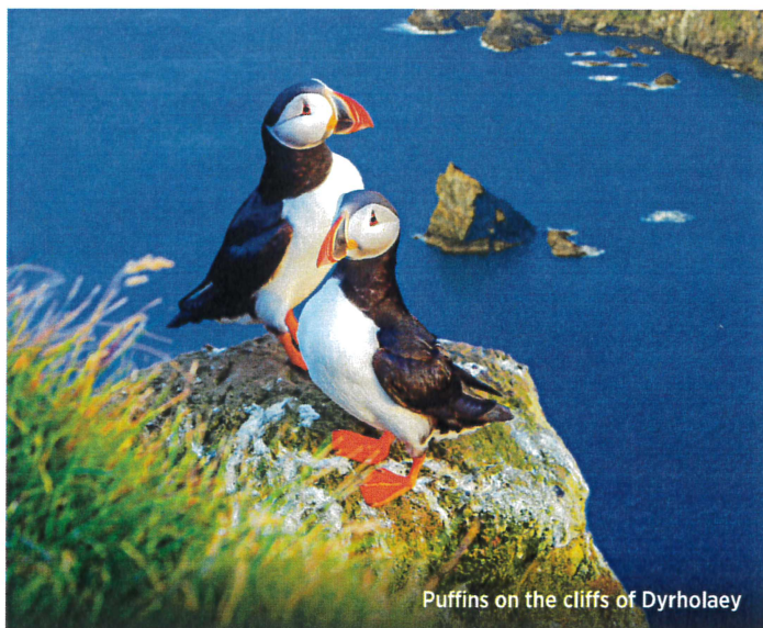
Puffins on the cliffs of Dyrholaey

A remarkable life enriching experience is a visit to the Blue Lagoon – a lake of warm, mineral-rich geothermal water, internationally renowned for its healing prowess. Located in the middle of a lava field in the pure and beautiful Icelandic wilderness, water is heated by underground volcanic activity at a depth of 5,400 feet and is pumped to the surface to form this man-made wonder. The Blue Lagoon is known for its special properties and its beneficial effect on the skin. Visitors from all over the world come here in search of health, relaxation and an exotic experience. You'll have an opportunity to soak in the pleasantly warm mineral-rich water. Meal: B