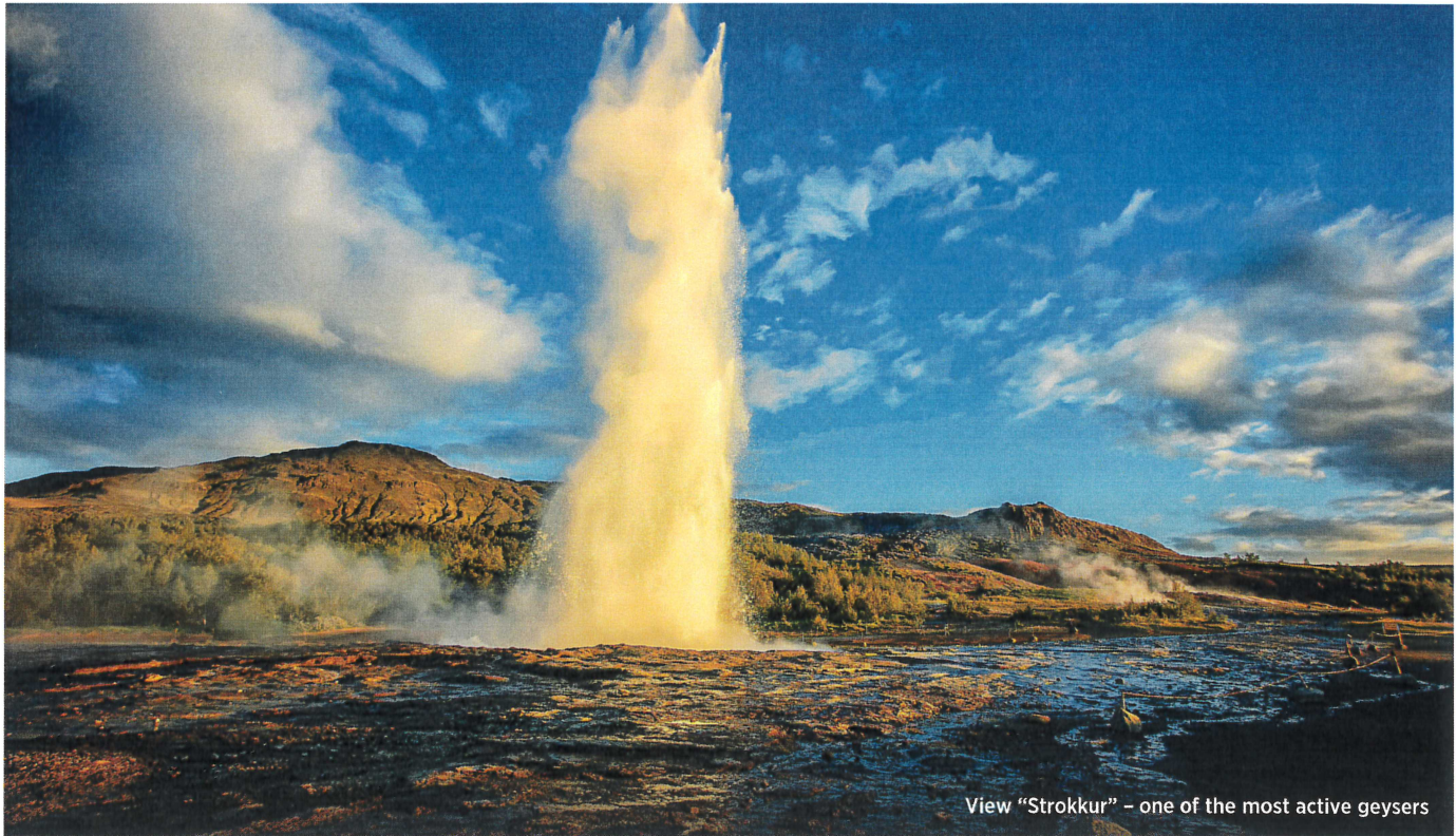
View “Strokkur” – one of the most active geysers

Iceland – Land of Fire and Ice Tour Code 512IC