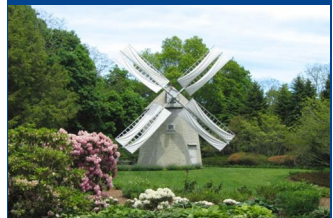
One of Cape Cod's many Windmills

Departure: Bank of Mauston, 503 Gateway Ave, Mauston, WI @ 8 am