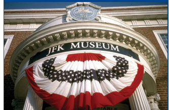
Visit to the JFK Museum